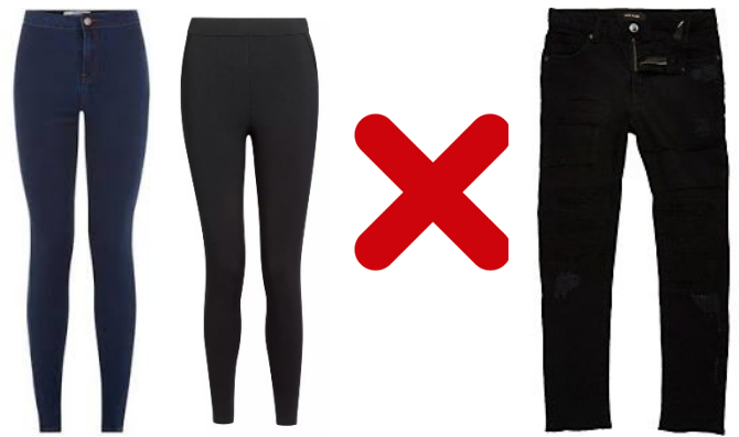
No jeans, leggings, denim or skin-tight