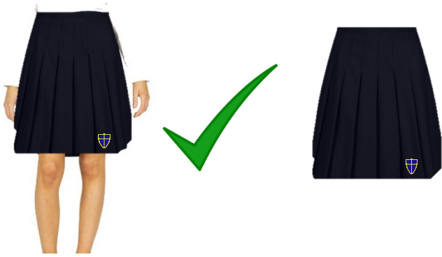
Length is just right with school logo