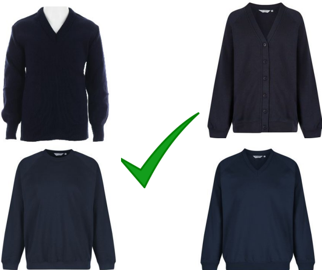
Plain navy knitted jumper or cardigan (round or v-neck); or navy sweatshirt (round or v-neck)