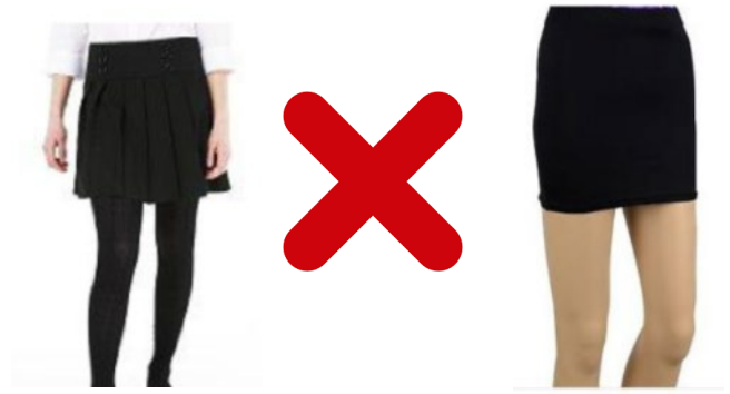
Too short, too tight, no logo