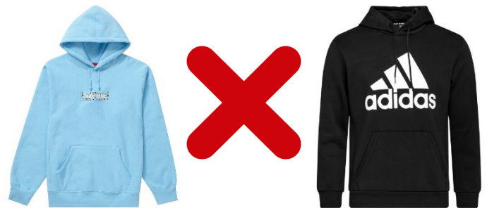
No hoodies or sweatshirts No logos or other colours