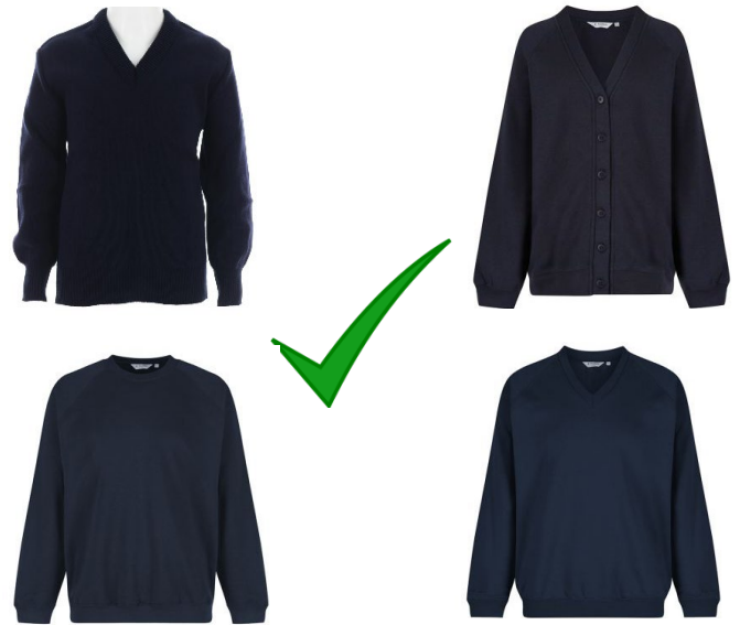
Plain navy knitted jumper or cardigan (v-neck) or round-neck sweatshirt or cardigan