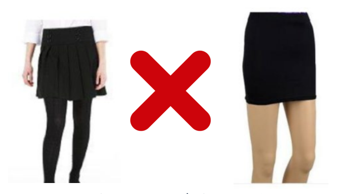
Too short, too tight, no logo