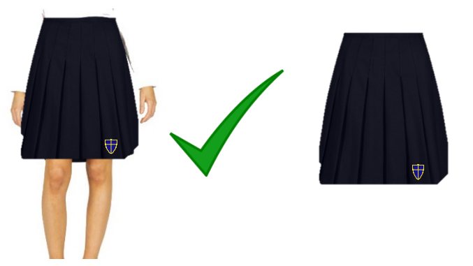
Length is just right with school logo