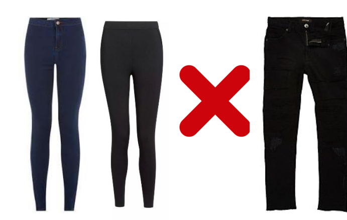
No jeans, leggings, denim or skin-tight