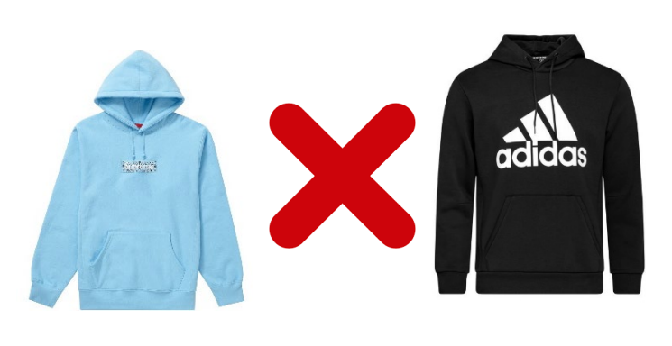
No hoodies or sweatshirts No logos or other colours