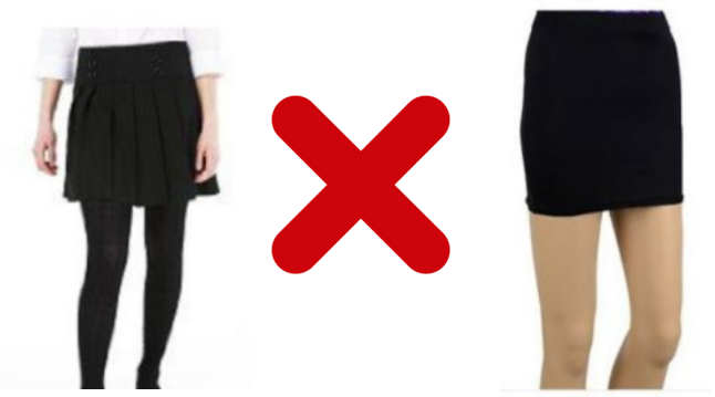
Too short, too tight, no logo