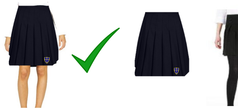
Length is just right with school logo