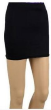
Too short, too tight, no logo