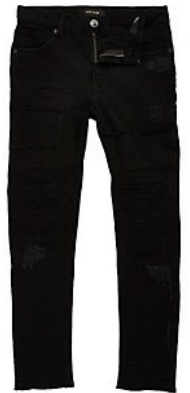
No jeans, leggings, denim or skin-tight