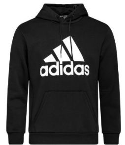
No hoodies or sweatshirts No logos or other colours