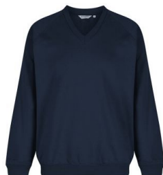
Plain navy knitted jumper or cardigan (v-neck) or round-neck sweatshirt or cardigan