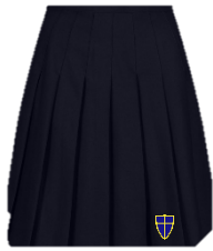
Length is just right with school logo