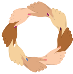
Year 8 student

I wish that everyone will have someone they love to spend Christmas with.